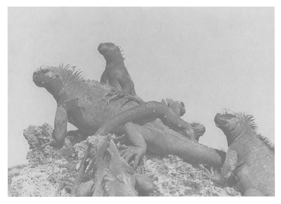
Figures 5.1 and 5.2. Marine iguanas ( Amblyrhynchus cristatus ) on the Galapagos Islands, gregarious but unable to interact in an affiliative and/or friendly way.